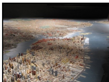
View from New Jersey looking toward Brooklyn.

If you have never seen this panorama, it is well worth seeing as it shows every building in all the boroughs, plus a bird's-eye view of the city that lets you see where everything is in relation to everything else.